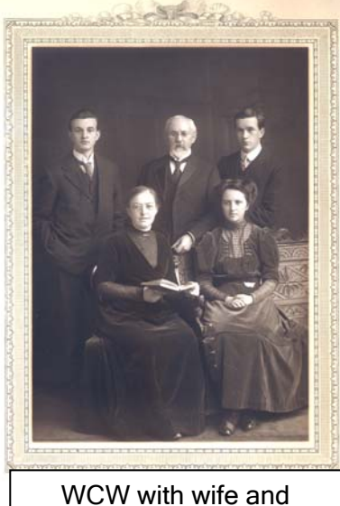
three surviving children about 1910

He was elected Vice-President of the Fourth International Congregational Council, 1920. He was awarded an honorary doctorate of sacred theology, Hartford Seminary, on his retirement in 1931. He then settled in Birmingham, where he lived until his death in 1938, aged 82.