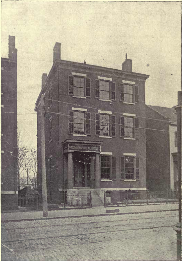
VIRGINIA HISTORICAL SOCIETY'S BUILDING, (War Residence of General R. E. LEE,) NO. 707 EAST FRANKLIN STREET, RICHMOND, VA.